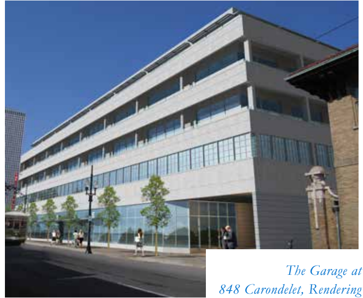
The Garage at 848 Carondelet, Rendering

With a strong market and anticipated regional job growth, conditions are ideal for new development. We anticipate several properties will break ground this year in the Historic